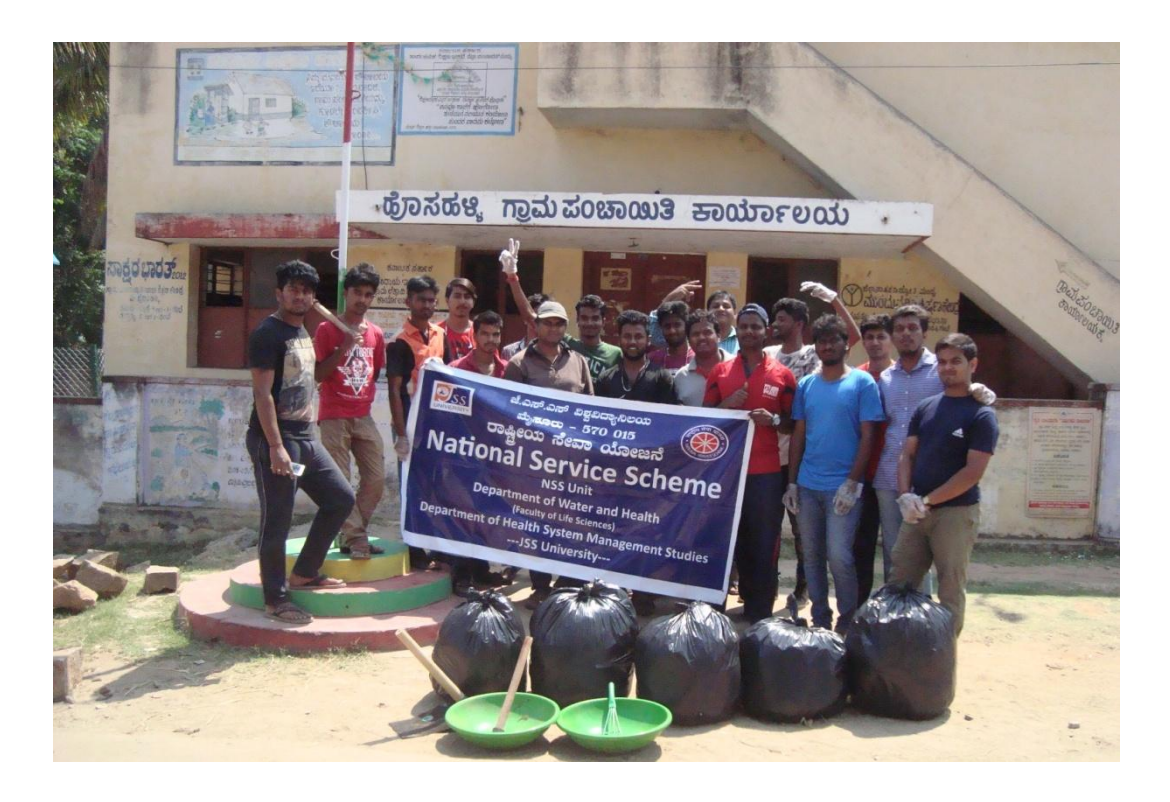
Submission of the wastes to panchayat office for proper disposal.