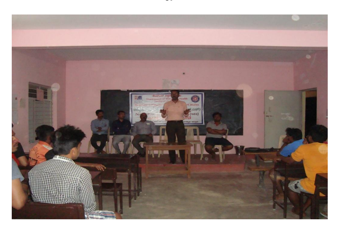
Interaction with Faculties.