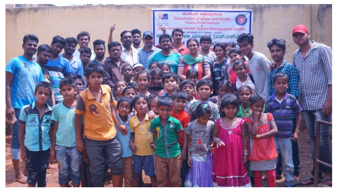
After plantation at Govt Primary School, Hoshalli.