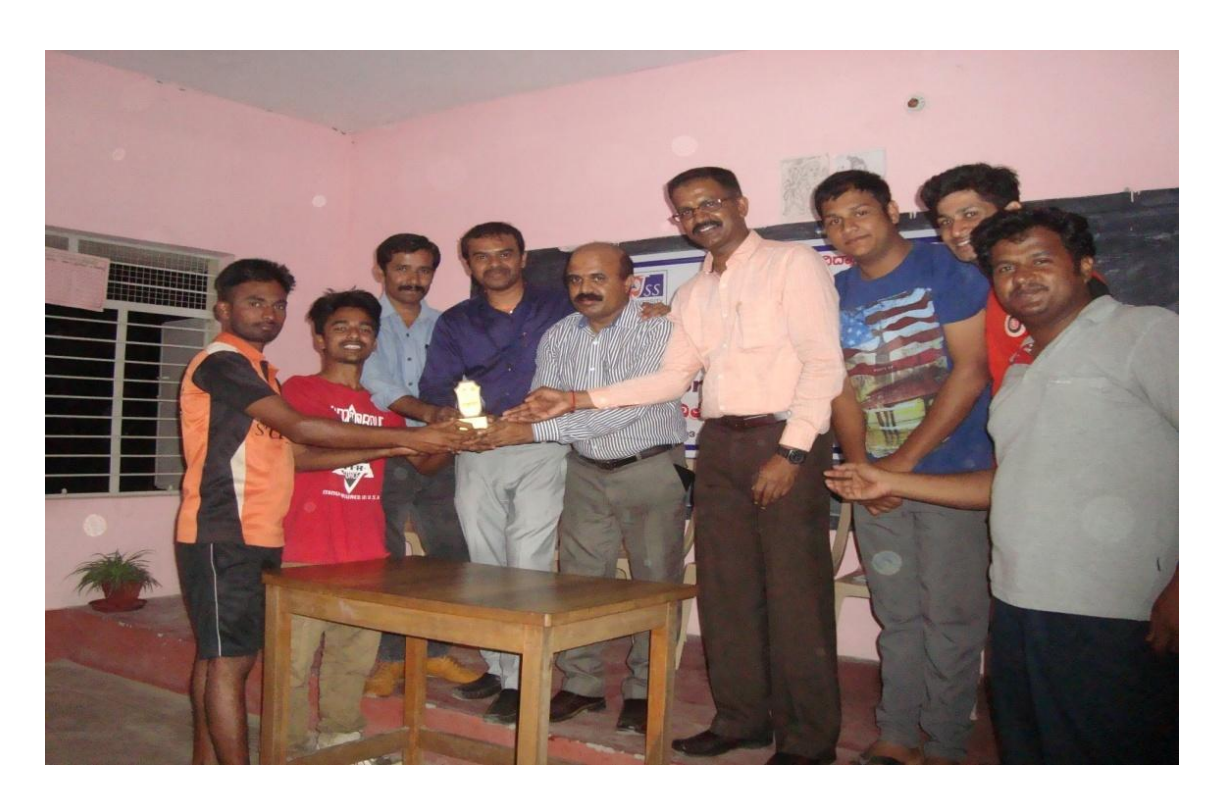
Winners of the debate were given prizes.