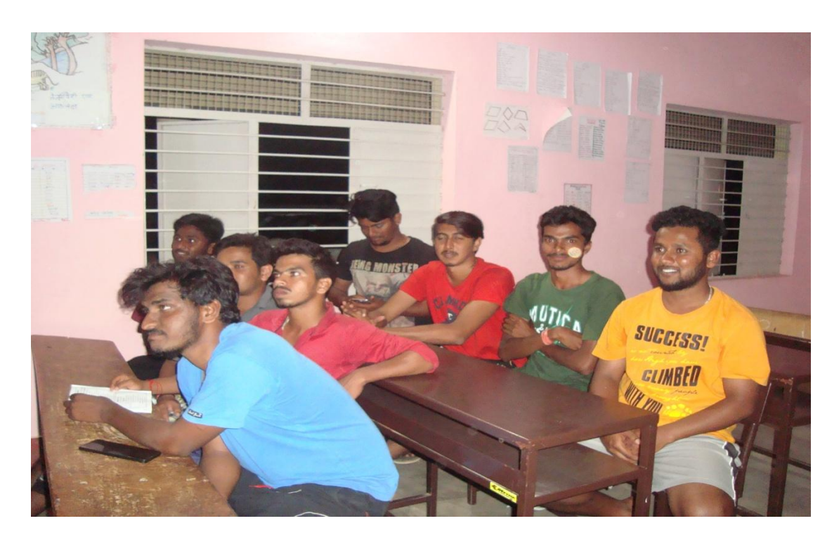
Volunteers actively participating during the debate.