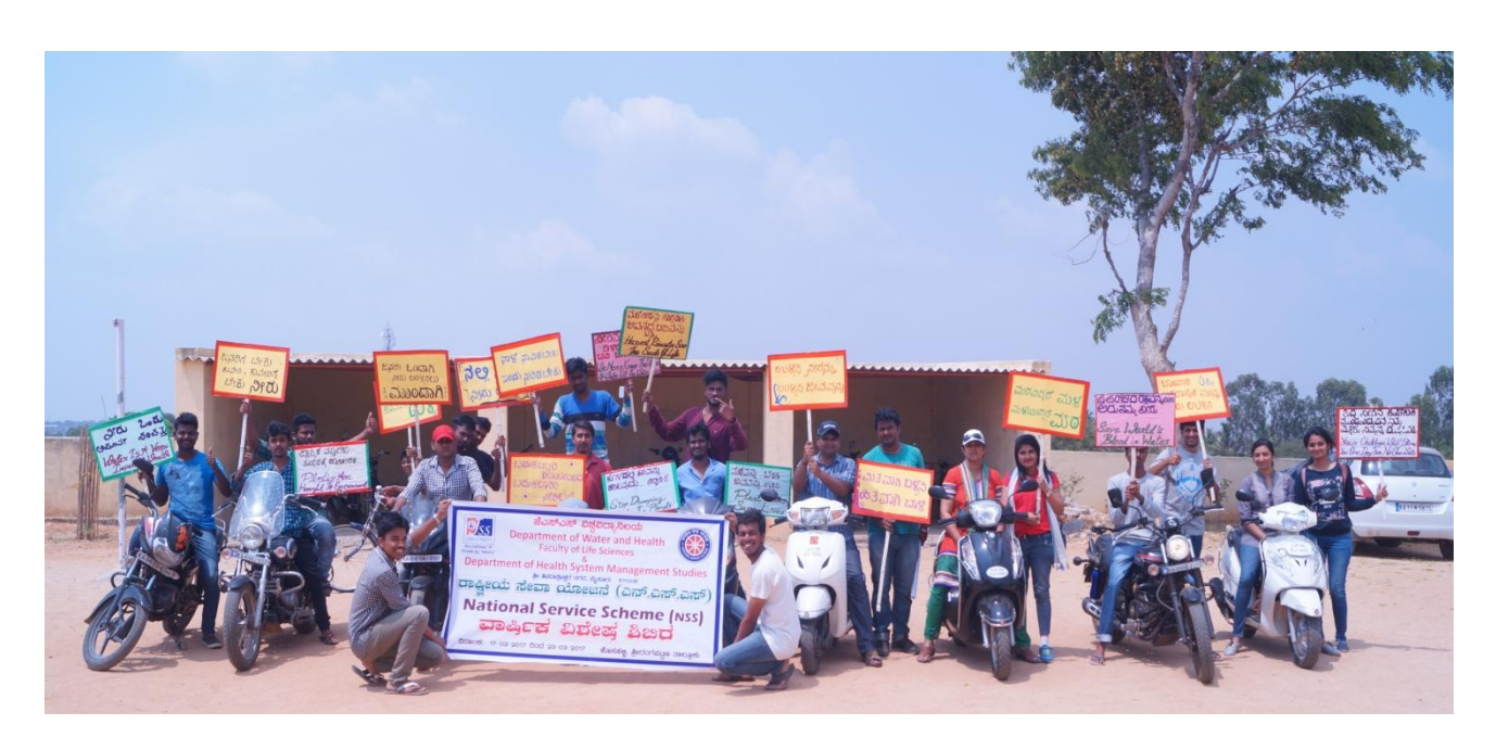
Rally at Hosahalli educating the importance of water during NSS Speical camp as a part of WORLD WATER DAY on 23<sup>rd</sup> March 2017. Volunteers from DWAH-FLS and HSMS can be seen participating.

Students were enlightened on importance of water. Students were shown placards with quotes of water conservation. Later the placards were shown during the rally in village on the way to Govt primary school. At night shibirajyoti was conducted and patriotic songs were sung by volunteers before hitting the bed.