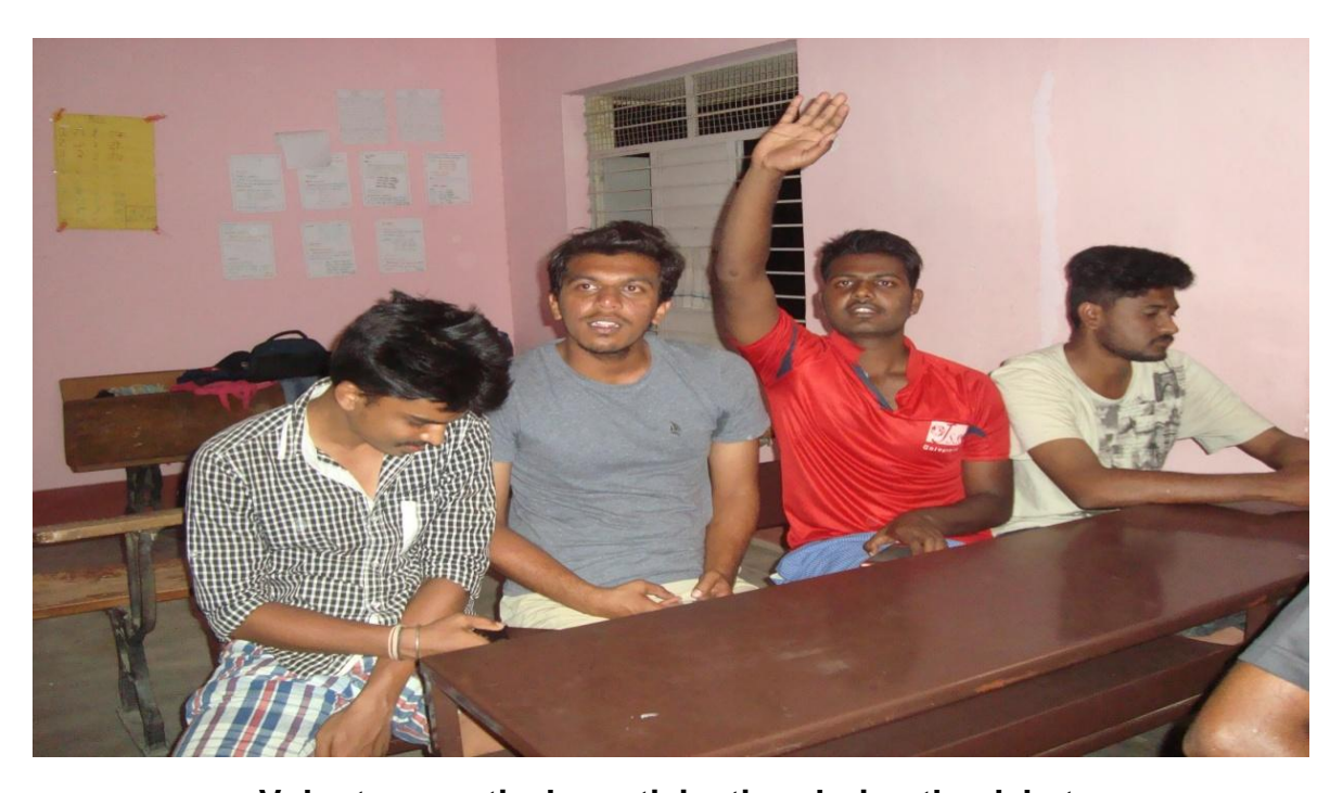
Volunteers actively participating during the debate.