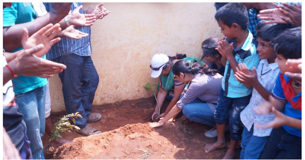
Planting of trees at Govt Primary School, Hosahalli as a part of WORLD WATER DAY on 23rd March 2017 during NSS Speical camp.