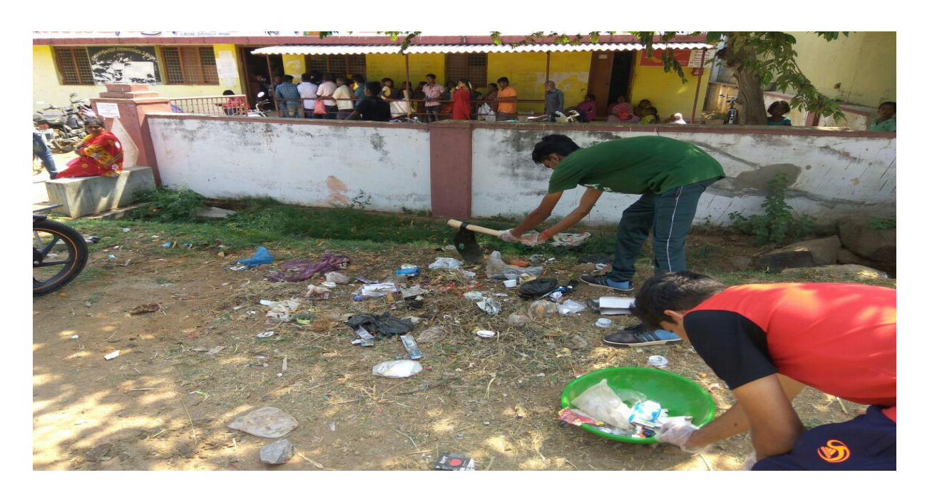
Volunteers during Shramadaan event.