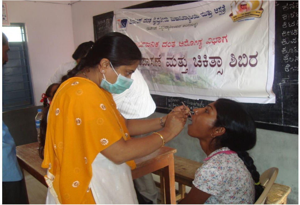
Dental check up by doctors and students of JSS Dental college