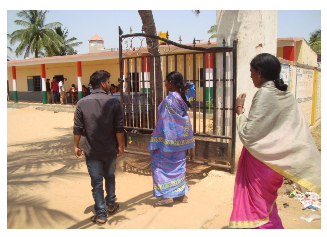
Volunteers encouraging the villagers for medical camp.