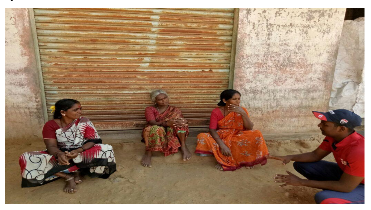
Volunteers interacting with the villagers.