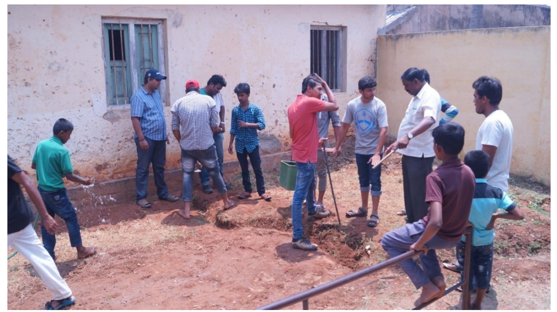
NSS Volunteers working for creating garden at Govt Primary School, Hosahalli as a part of WORLD WATER DAY on 23rd March 2017 during NSS Speical camp.