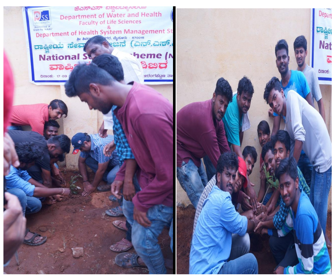
Planting of trees at Govt Primary School, Hosahalli as a part of WORLD WATER DAY on 23rd March 2017 during NSS Speical camp.